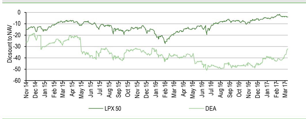
Exhibit 9: DeA and LPX50 discounts to NAV

More fundamentally, the renewed momentum and longer-term growth potential of the alternative asset management business, and the likely future net distributions from the relatively diverse and mature investments in private equity funds, are both supportive of continued value generation as well as distributions to shareholders.